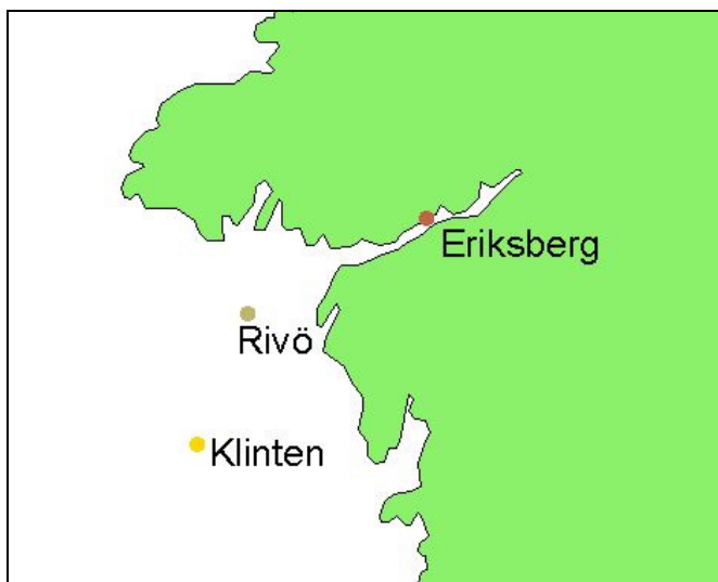
Figure 2. The sampling site Eriksberg is located at the outlet of Göta Älv, and the sampling sites Rivö and Klinten at the inner part of the estuary.

The sediment samples were collected at three sites in the Göta Älv estuary close to Göteborg at the Swedish west coast in September 2007, see Figure 2. Two samples were collected at the sites Eriksberg and Rivö, respectively, and one sample at the reference site Klinten.